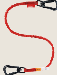
Tether 6.8kg (15lb) #2261970