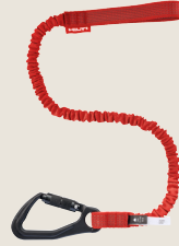
Tether 11.4kg (25lb) #2261971